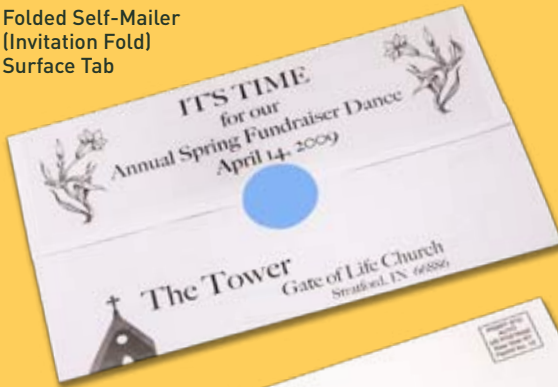
Folded Self-Mailer (Invitation Fold) Surface Tab