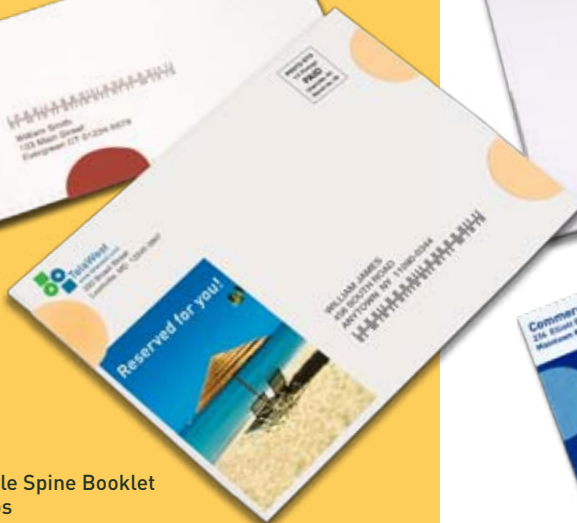
Simple Spine Booklet 3 Tabs