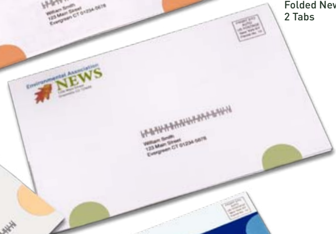
Folded Newsletter 2 Tabs